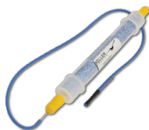
Drying Tube Assembly