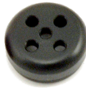
Open-faced Nose Cap