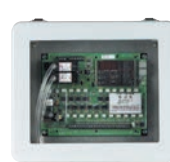
DCT in optional NEMA 4/4X weatherproof enclosure.