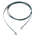
Model DCAC02 Cable Connection: For connecting multiple boards.