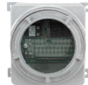
DCT in optional Explosion-proof Enclosure.