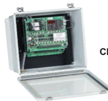
Master Board Stacked with Channel Expander.