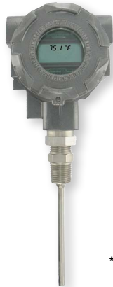
*Shown with optional LCD display

User Selectable Ranges, Optional LCD Display