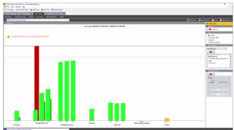
Fluke Energy Analyze Plus: Power quality health summary