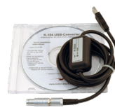
RS485 Converter Cable