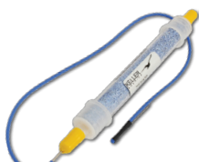
Drying Tube Assembly