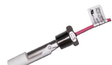
LS-7 Float Reed Switch