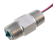
ELS-1150 Electro-Optical Liquid Level